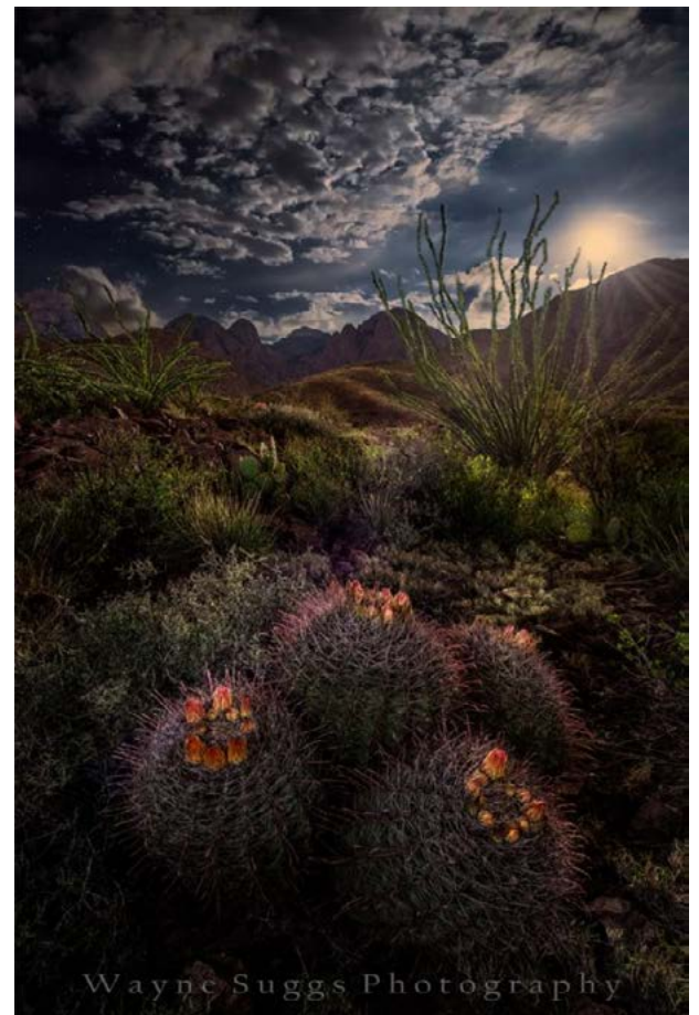
Wayne Suggs Photography

“GETTING THE CAMERA OFF AUTO MODE” – This workshop will focus on participants getting the photograph they want by gaining an understanding of aperture priority and shutter priority settings on their camera, plus the value of both. The instructor will break down the exposure triangle (shutter speed, aperture, ISO) so participants can understand and use their relationship. Following that there will be small group hands-on time to help participants learn how to change these settings on their own camera. Participants will then go out into the downtown area to take photographs based on the exposure triangle, aperture and shutter speed presentations provided during the workshop. Members from the DAPC will be available for assistance during this practice session. Participants will return to the workshop environment for small group discussion and to provide a venue to answer questions