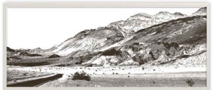
Edit That Photo "Death Valley Etching" by Anne Chase.

This is the fourth class in the 5-part photography boot camp series