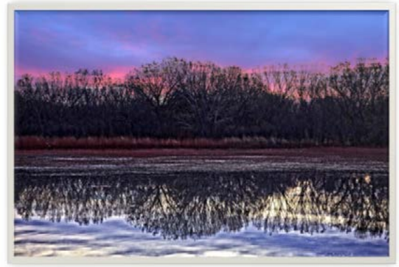
Edit That Photo “ Reflection ” by Victor Gibbs.