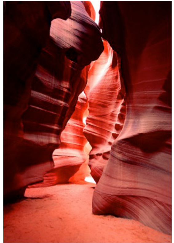
"Slot Canyon" by Mitch Carleton

May's theme is Mobile Photography . Submit up to three of your best smartphone shots by sending them to Kristi Dixon at themes@daphotoclub.org by Saturday, May 13. Photos should be in JPG format, and should not exceed 2MB in size. Keep them no bigger than 1920 pixels wide and 1080 pixels tall. Include your name and a title with each photo.