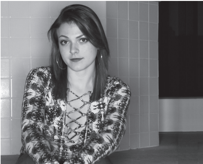
by Tabitha Granger