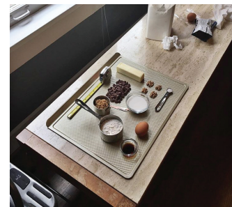
"Behind the Scenes" by Lynsey Creative