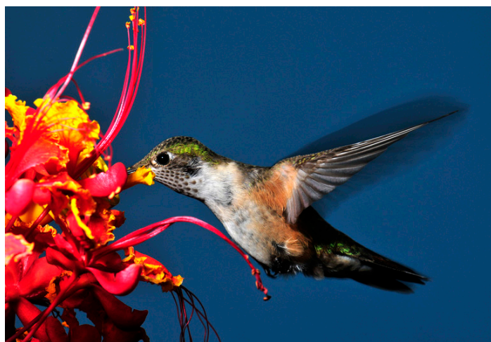
Broad-tailed Hummingbird by Nirmal Khandan

Bring a tripod, and either a 300 mm lens on full frame bodies or a 200 mm with a crop sensor bodies for best results. Remote release will also be useful. Attached photo shows the location of the shoot, which has been approved by BLM and the Park Manager. The plan is to shoot from the shaded patio on the left side of the entrance to the Visitor Center, from about 8 to 10 a.m. This time of day has nice side light coming off of the mountains that should help capture some nice close-ups. For any questions, call Khandan at 575-520-0004.