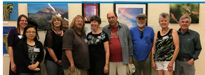
Blue & Red Ribbon Winners