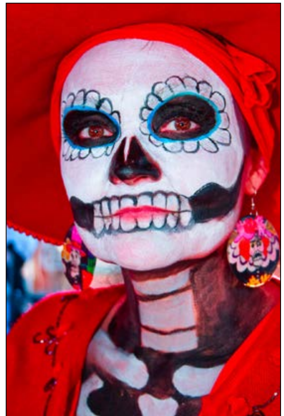
"Day of the Dead" by Anne Chase

Next month's theme is Love. Members should submit up to three images using the