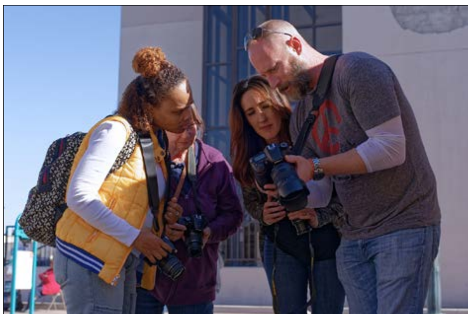
Learning Your Camera by Seth Madell

This workshop will focus on participants getting the photograph they want by gaining an understanding of aperture priority and shutter priority settings on their camera, plus the value of both. The instructor will break down the exposure triangle (shutter speed, aperture, ISO) so participants can understand and use their relationship. Following that there will be small group hands-on time to help participants learn how to change these settings on their own camera. Participants will then go out into the downtown area to take photographs based on the exposure triangle, aperture and shutter speed presentations provided during the workshop. Members from the DAPC will be available during for assistance. Participants will return to the workshop environment for small group discussion and to provide a venue to answer questions