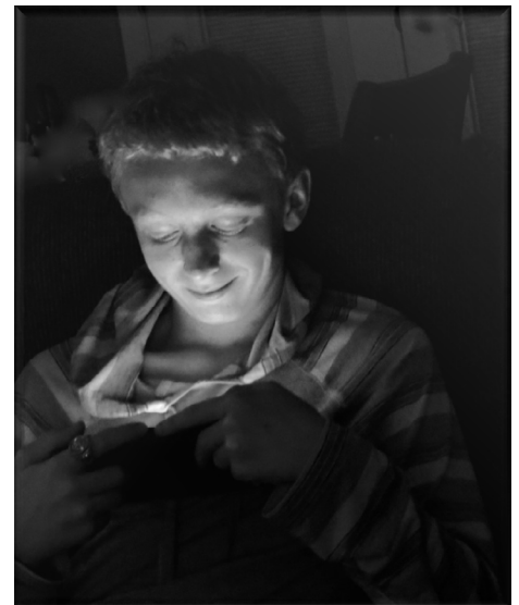
“Awe Technology” by Til Zimmerman

March’s theme presentation gave us 42 images from 15 club members. Many of the photos were darkened subjects on black or nearly-black backgrounds. Silhouettes were also notable. A few images were shot from a low vantage point, looking upward (that is, exposed from “under”). And an interestingly high percentage of the images were