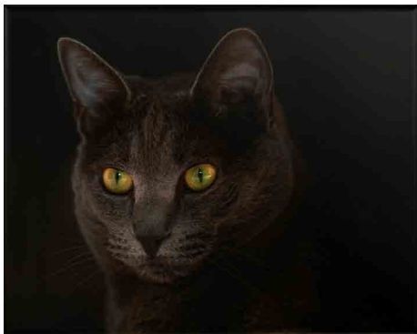
“Shadow Kitty” by Kristi Dixon

So, too, can we talk about “low key” photos. These are images purposely rendered darker than average.