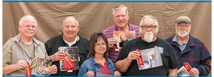
Blue & Red Ribbon Winners