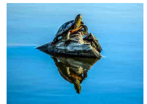
"Turtle Power" by Gerald Guss