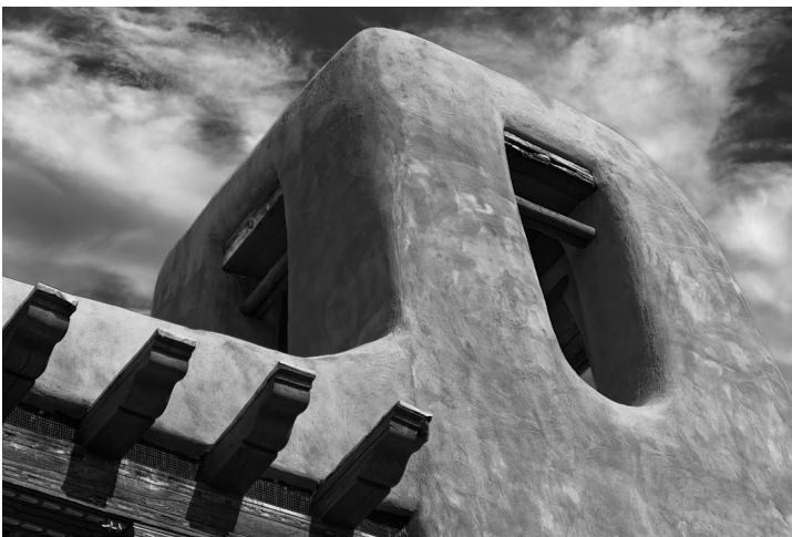
"NM Museum of Art" by Seth Madell