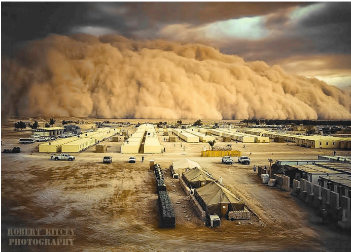
"Haboob"