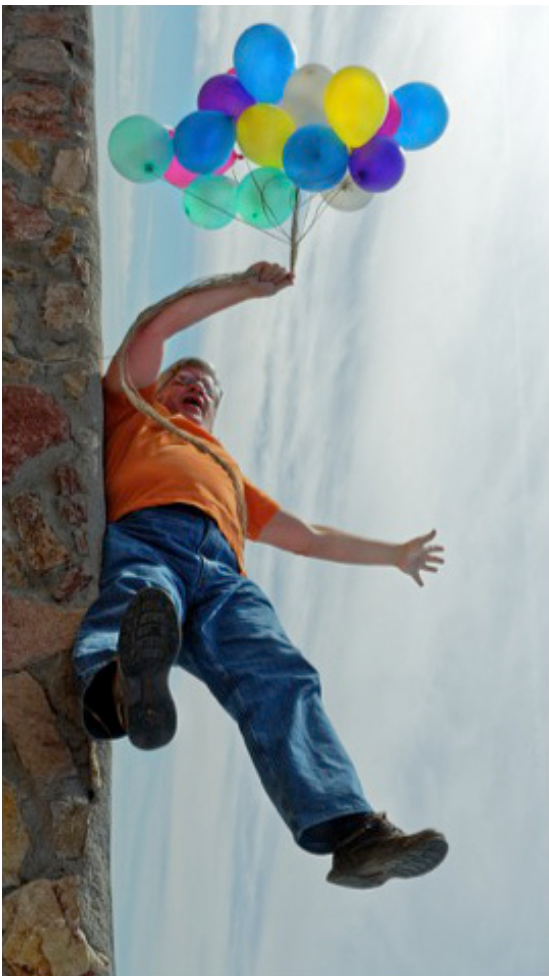
"Up!" by Seth Madell