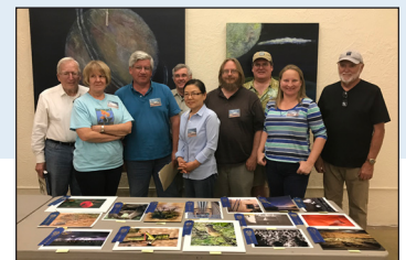
Blue Ribbon Winners

Photography Bootcamp Editing 9 a.m. to noon SWEC